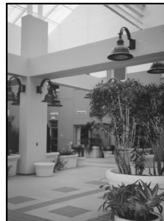
Northeast Center for Special Care "Desert Eden" bringing the outdoors-indoors.

Turn the corner from the bustling Route 9W shopping strip just outside of Kingston, N.Y. onto Grant Avenue, and find an oasis for health care named the Northeast Center for Special Care. Tucked in a quiet corner of Lake Katrine, it stands amid a 39-acre campus of tall trees which secludes the modern two-story, 209,000 square foot facility. It is the only one of its kind in New York offering long-term rehabilitation for brain and spinal cord injuries. It gives testimony to the power of state of the art health care and to the power of economic development in New York State.